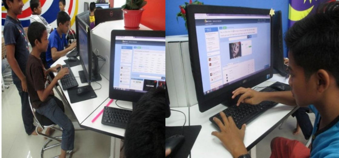
Peserta pertandingan CrossWord tekun mencari perkataan atas talian.