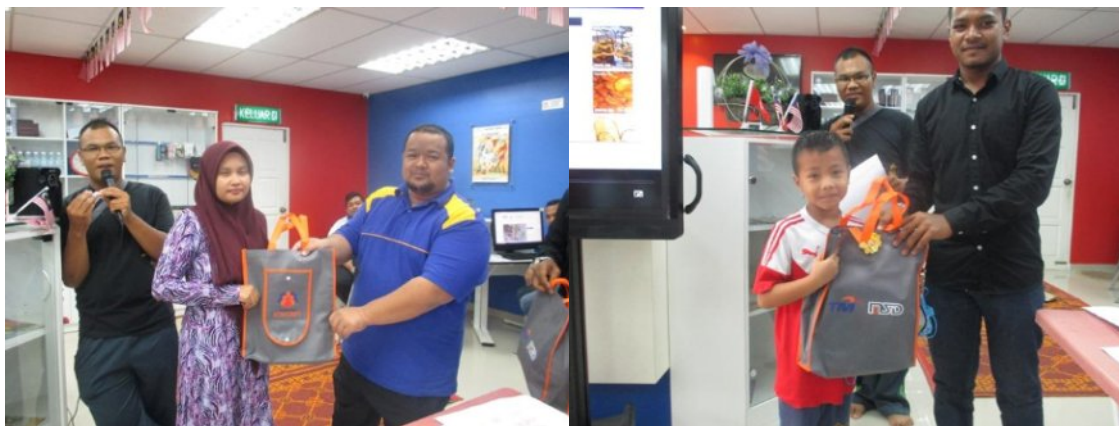
Acara penyampaian hadiah kepada pemenang dan cabutan nombor bertuah kepada pengunjung.